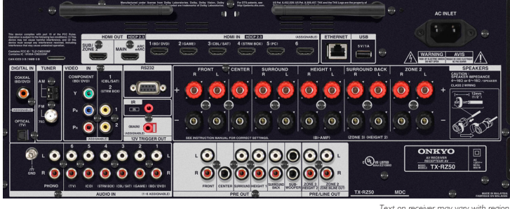
Text on receiver may vary with region