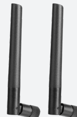
2 x External Antenna