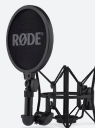
1 x NT5