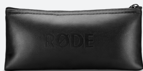
1 x ZP1