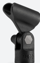
1 x RM5