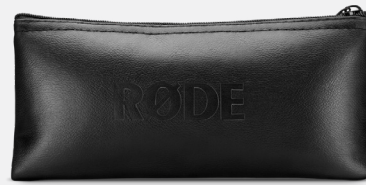
ZP1 Zip Pouch